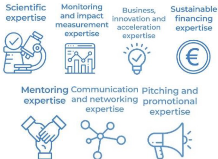
FIGURE 1: BLUEACTIONAA’S TECHNICAL ASSISTANCE AREAS

The specifics of individual technical assistance and mentoring needs will be determined through an iterative approach conducted during the application process. BlueActionAA’s technical assistance thematic range covers the areas shown in Figure 1 and may include both social and natural science domains in line with the Mission objectives in the Atlantic and Arctic lighthouse area (e.g., training in monitoring methodology, stakeholder engagement, cost-benefit assessments etc.).